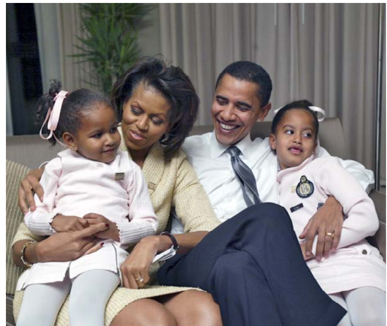
Barack and Michelle Obama with their daughters, Malia (mah-LEE-uh), 6, right, and Sasha, 3, in 2004

After finishing law school, Barack moved back to Chicago. He worked for a law company. He met a lawyer named Michelle, and they became friends. Barack invited her along when he visited some of the people he had helped in the 1980s. Michelle was moved by Barack's desire to help people and improve the world. Barack and Michelle married in 1992.