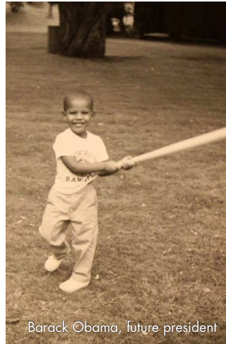
Barack Obama, future president

Every child dreams about growing up. Some children know what they want to be as adults. Others have no idea. Some do not find a direction for their life until they are adults.