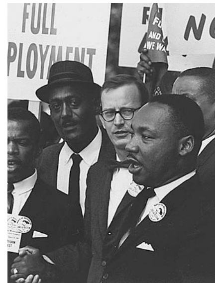
U.S. civil rights leader Martin Luther King Jr. inspired Barry.

In Hawaii, Barry again felt like an outsider . He was one of only two African American students in his class. Some of his classmates made fun of his unusual name.