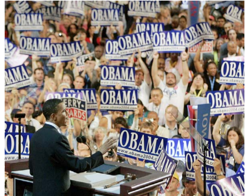
Barack spoke during the 2004 Democratic National Convention.

In 1996, he won a seat in his state's senate. In 2004, he won a seat in the U.S. Senate.