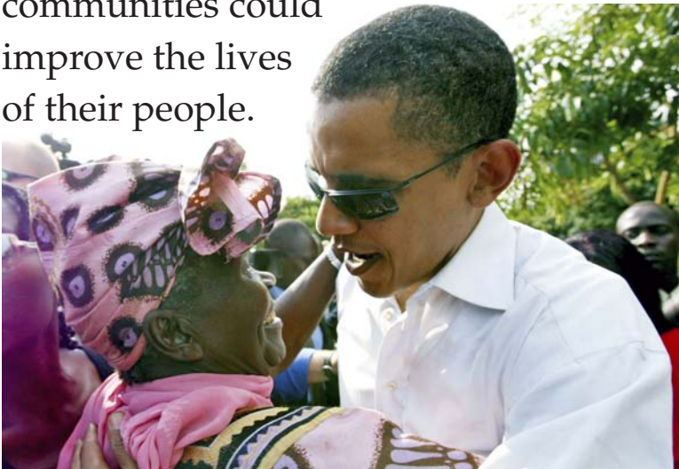
Barack with Mama Sara Obama, his Kenyan grandmother

Barack's work in Chicago made him happy because he was helping poor people. But he saw that to make lasting changes, he would need to learn how to change laws. By changing unfair laws, communities could improve the lives of their people.