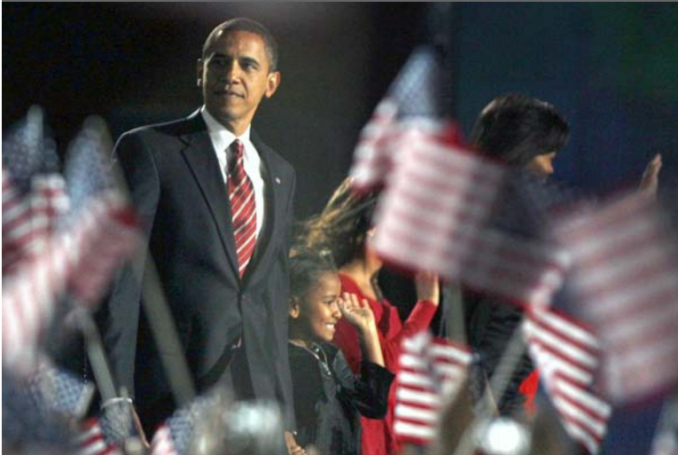
Barack Obama spoke to a huge crowd after being elected president on November 4, 2008.